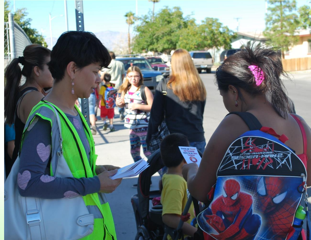
Thank You for Driving Safely Campaign at McWilliams ES