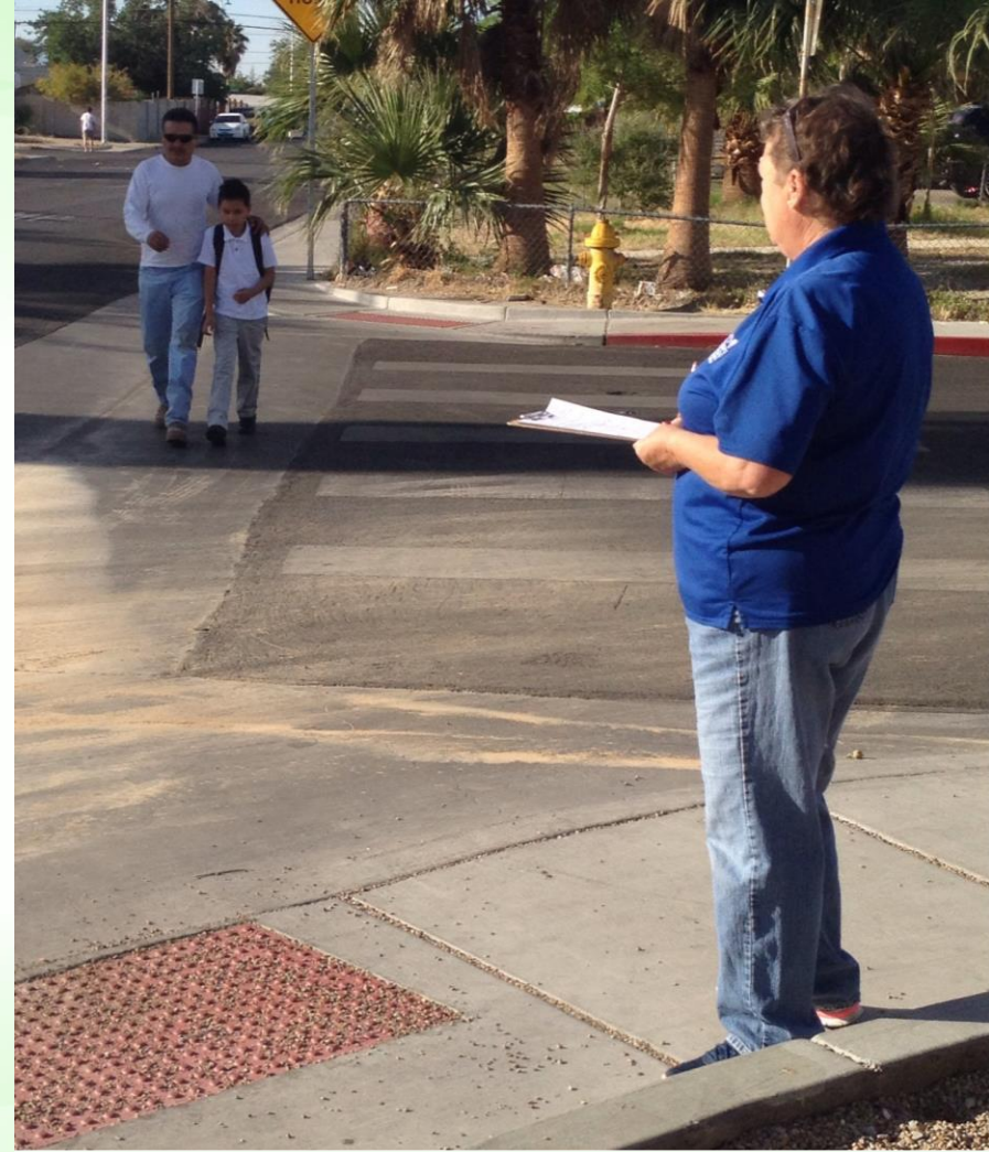
Bicycle and pedestrian count at Lunt ES