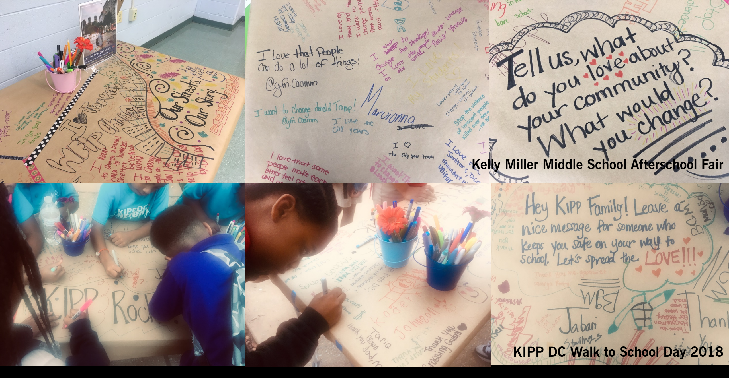
Butcher paper, markers, and a good question go a long way!