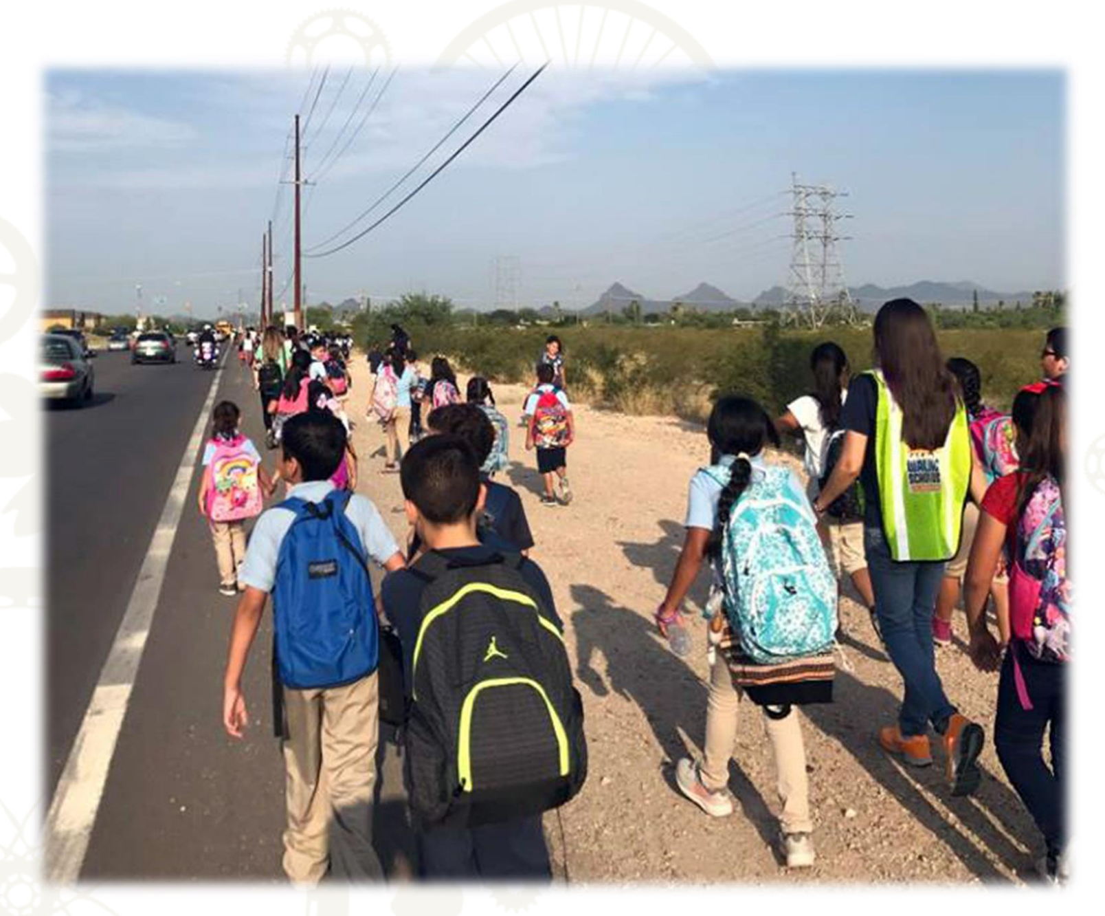
Teachers & parents at Los Amigos Academy lead ~150 students on walking/biking routes every Friday