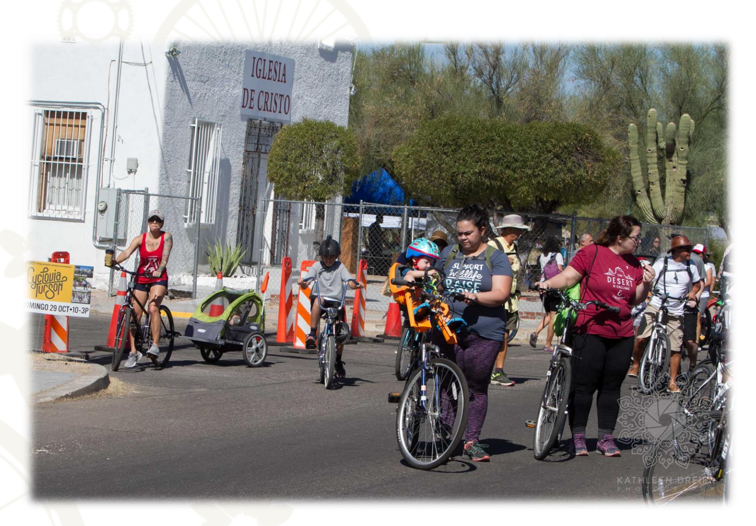
Cyclovia Tucson en la Avenida Doce