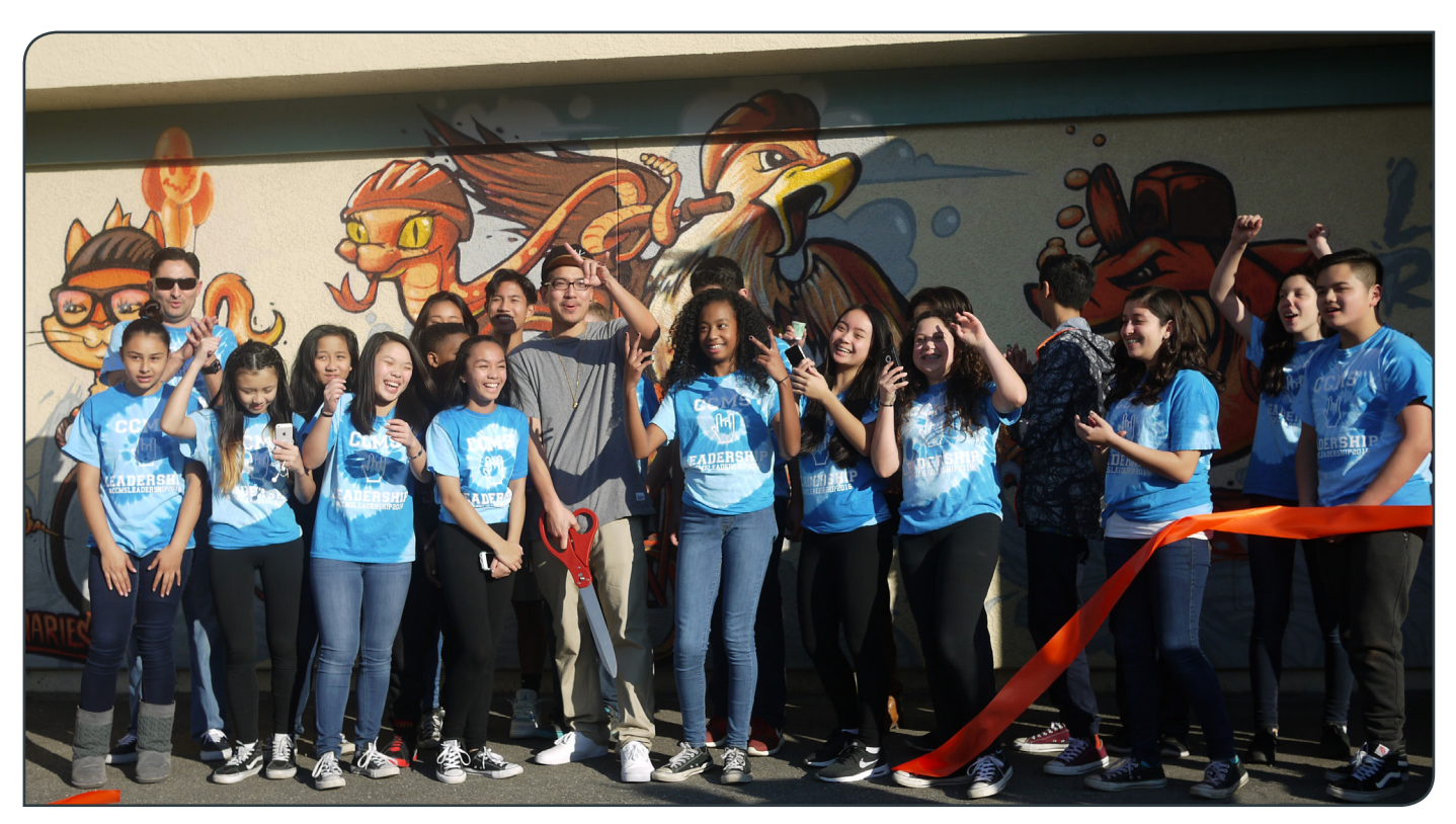
The Student Leadership Class at Cesar Chavez Middle School in Union City, California designed and painted a bicycle-themed mural to designate a safe space for securing bicycles at school.

These lessons and approaches provide a very promising basis for Safe Routes to School programs and others to begin more proactively acknowledging and addressing street harassment. By exploring, implementing, and evaluating these approaches, Safe Routes to School programs can assist in developing a more evidence-based and sophisticated understanding of how to intervene successfully in street harassment. By working to create an environment in which the walk to school is free of harassment, Safe Routes to School programs can help youth and others walk and bicycle on streets and public spaces in comfort and confidence.