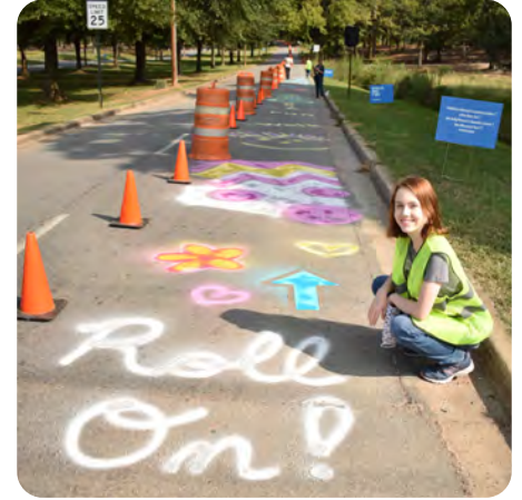
Walk and Roll Lane (Little Rock, AR)

Little Rock, Arkansas (2020 Grantee, Central Arkansas Library District): We helped them build partnerships and identify community needs that led to a month-long, temporary “walk and roll” lane connecting Memorial Park to a neighborhood south of Interstate 630. This project physically bridged the racial divide of the interstate, offering a safe walking and biking route to the park. In 2021, Little Rock received about $1 million in Transportation Alternatives funding from their Metropolitan Planning Organization, and the city provided a 20 percent match to fund permanent walking and biking improvements where the Safe Routes to Parks demonstration project was the year before. The coalition building the grantee did during our program and the resulting action plan made it easy for the director of public works to say “yes” to the permanent project and support their funding application. Read more: Innovative Library and Parks Department Partnership Demonstrates Safer Connections for People and Parks via Highway Bridge