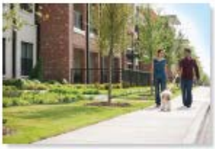
Go for a walk