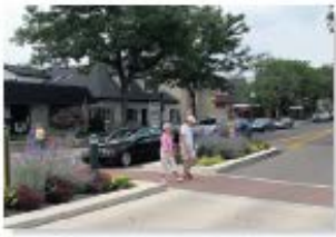
Safely cross the street