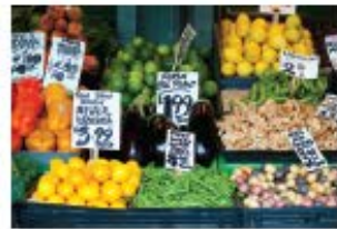
Buy healthy food