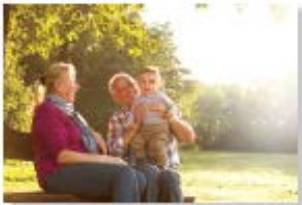
... and make their city, town or neighborhood a lifelong home.