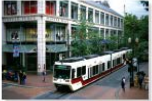
Get around without a car