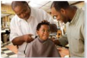
Find the services they need