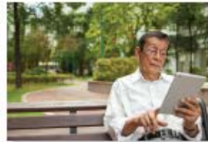
Spend time outdoors