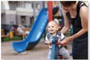
Enjoy public places