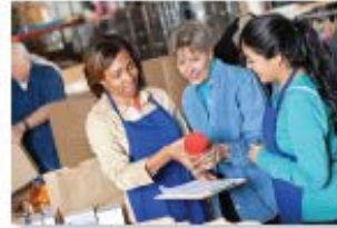
Work or volunteer