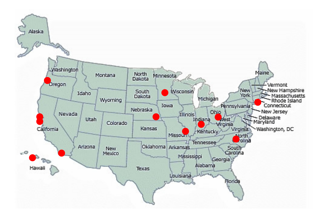
Figure 2: Map of Eleven Featured Efforts

The eleven efforts have been categorized by their scope, from micro-level neighborhood changes to broader citywide and countywide changes, and finally more macro-level state changes. The eleven are also geographically diverse, spanning the country from coast to coast (see Figure 2).